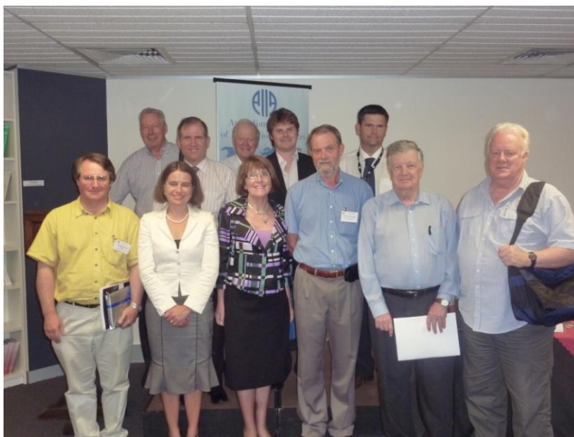
DFAT Historical Publications and Information Section officials and publication authors at The History of Australia's Involvement with the United Nations Forum Stephen House, 1-2 February 2011

A book of research is in preparation for release by the DFAT Historical Publications and Information Section in September 2011.